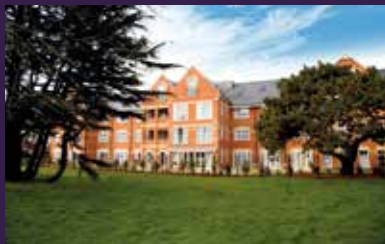
Fairmile Grange Christchurch