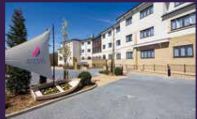
Hamble Heights Fareham